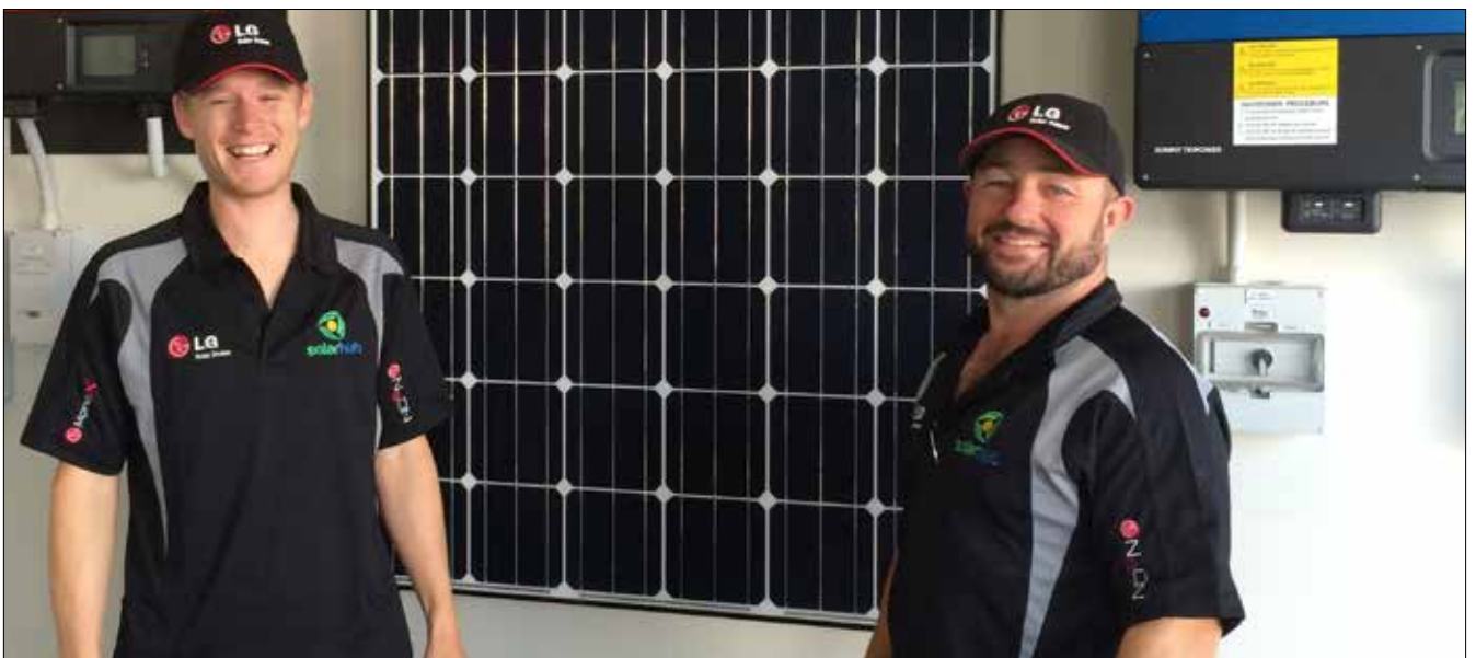
Solar Hub - ACT