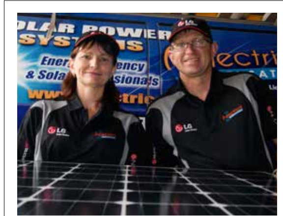
Electrical Sensations - Queensland

We also recommend you check out lots of consumer friendly solar information on lgenergy.com.au